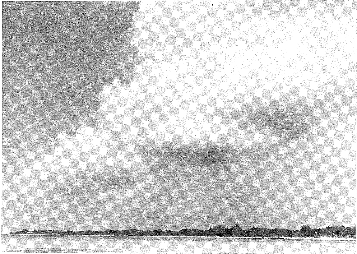
Plate 1. The south coast of Little Cayman, from the southeast; noon cumulus extending along the length of the island